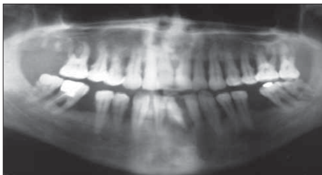
FIGURE 2. Initial radiological findings

Orthopantomographic examination showed generalized horizontal bone loss with localized angular bone defects at teeth no. 44 and 33, furcation involvement in all molar teeth and periapical pathology in teeth no. 16 and 26, incorrect endodontic treatment on tooth no. 47 and presence of submerged vestibular roots of tooth no. 17. (Fig. 2)