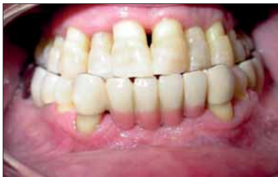
FIGURE 4. Clinical aspect 1 year after completion of active periodontal therapy

Clinical and radiographic reevaluation was performed 15 months after initial presentation and 12 months after surgical therapy (Fig. 4, Fig. 5). Also, blood investigations were performed at 11 month from initial presentation; negative C reactive protein and normal erythrocyte sedimentation rate were found.