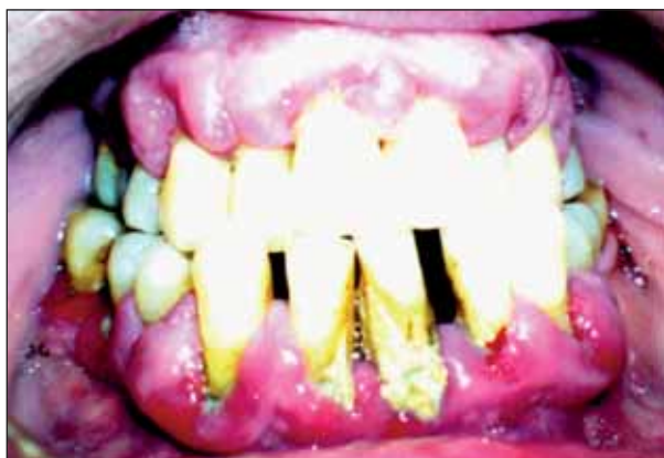
FIGURE 1. Generalized gingival overgrowth

Generalized gingival overgrowth (GO) was present on both facial and oral surfaces with red, ulcerated and lobulated papillae, gingival margins and attached gingiva, less pronounced at the lower left sextant; purulent secretion was evident in the gingival sulcus. Patient's oral hygiene was poor with heavy generalized plaque and calculus deposits throughout dentition. (Fig. 1)