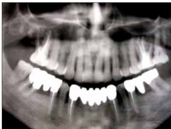
FIGURE 5. Radiological aspect 1 year after completion of active therapy