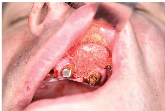
FIGURE 7. Wound packing with iodoform gauze over the vestibular mucosal flap at the end of the cystectomy procedure