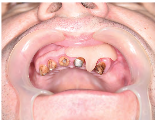
FIGURE 9. Obturator prosthesis partially protecting the cystic cavity until complete healing and tissue remodeling

Also, interleukin-1 \alpha (IL-1 \alpha ) and interleukin 6 (IL-6) are thought to be involved in cyst expansion because the intra-cystic pressure induces the release of these cytokines which stimulate bone resorption by activating the osteoclast cells (8).