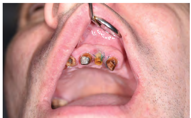
FIGURE 3. Decompression using a silicone tube placed in the post-extraction socket of tooth 22