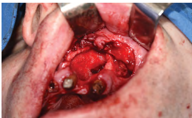
FIGURE 6. Intraoperative aspect of the cyst cavity following cystectomy