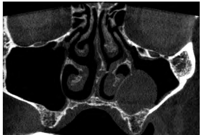
FIGURE 2. Coronal cone beam computed tomography scan before surgical treatment, showing a radio-opaque area involving the left maxillary sinus and the inferior meatus of the nasal cavity

The periapical cyst develops from remnants of Malassez epithelium, which proliferates and forms the cystic wall (6). The expansion takes place through several mechanism: the destruction of extracellular matrix by collagenase on one hand and by bone resorption determined by osteoclast-like cells on the other hand (7).