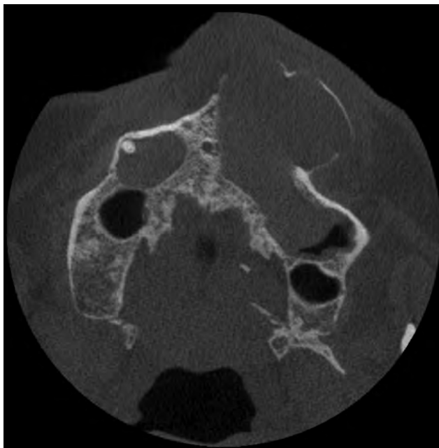
FIGURE 1. Axial cone beam computed tomography scan shows a radio-opaque area involving the upper maxillary alveolar process and the left maxillary sinus with the forward expansion of its anterior wall

Imaging examination revealed large cystic lesions extending towards surrounding structures: the nasal cavity, hard palate and the maxillary sinus (Fig. 1, 2).