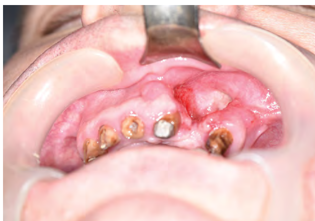
FIGURE 8. Postoperative aspect of the epithelized cavity three weeks after the cystectomy procedure