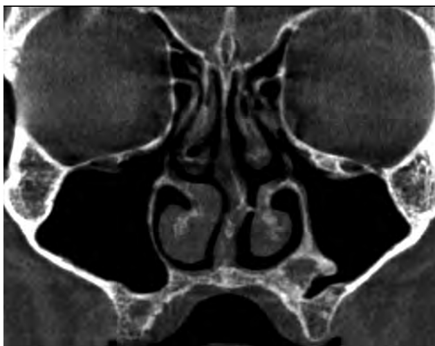
FIGURE 5. Coronal computed tomography image, 8 months after decompression, showing the recovery of the anatomical architecture of both maxillary sinus and the nasal cavity