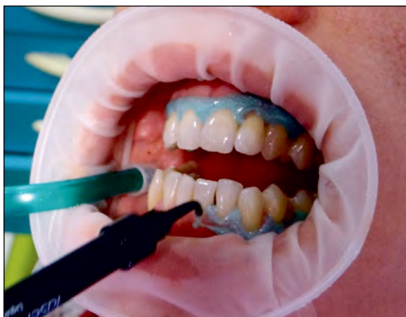
FIGURE 3. Application of the gingival barrier

In the kit we also find a fluoride gel syringe designed to protect the teeth after this procedure and applicator tips.