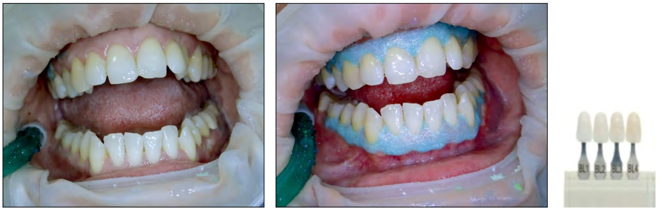
FIGURE 7. Final appearance, shade BL2 (VITA Bleaching key)