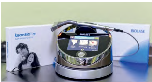
FIGURE 4. Biolase bleaching putty and Epic Dioda 940 nm laser (Biolase USA)

The application of the whitening gel will be done on each tooth separately in a uniform layer of approx. 2 mm (fig. 5).