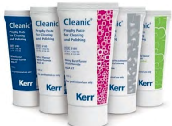
FIGURE 1. Cleanic polishing paste (Kerr)

properties to the same extent, without the risk of affecting the dental tissues [7] (fig. 1).