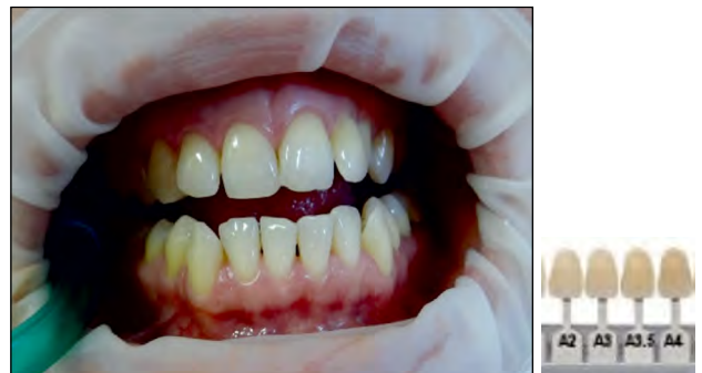
FIGURE 2. Initial appearance, initial color A3

The color was set with the VITA Bleaching Key (Vita Zahnfabrik, Bäd Sackingen, Germany), the initial color is A3 (fig. 2).