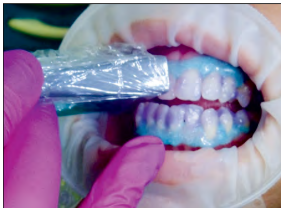
FIGURE 6. Activation of the peroxide gel with the bleaching piece light by Epic Biolase laser

The gel will be activated by laser light, using the Epic diode with a wavelength of 940 nm. A special whitening end is used, which will diffuse the laser light evenly over side. The actuation time is 30 seconds for each side, at a power of 7 Watts, below the continuous wave (CW) (fig. 6).