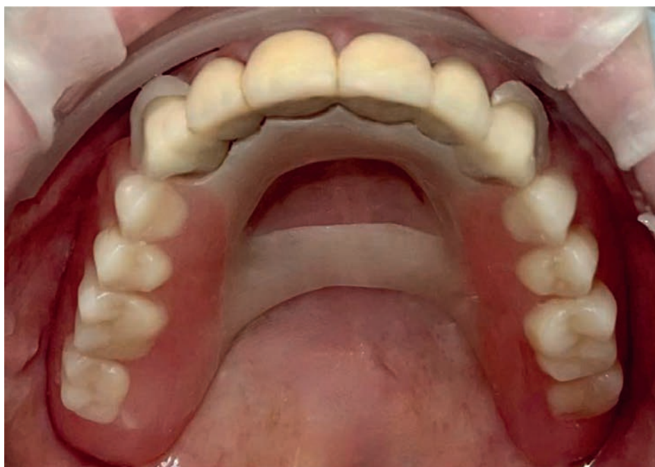
FIGURE 1. Flexible partial dentures with uncovered palatal vault for maxilar

Following the application of the prostheses, patients generally demonstrated good adaptation,