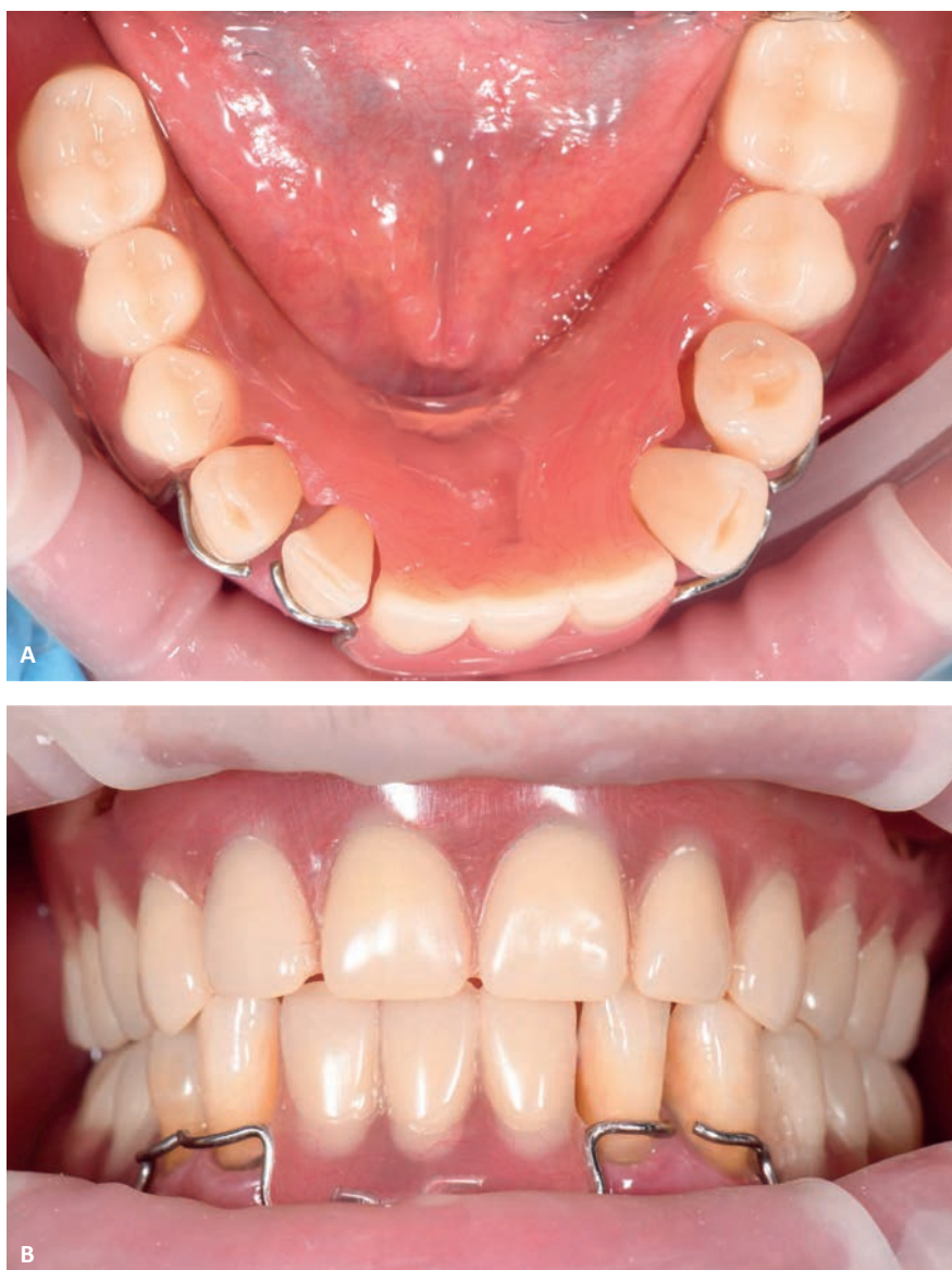
FIGURE 3. (A) Traditional acrylic partial dentures frontal view in oral cavity; (B) Traditional acrylic partial dentures frontal view in oral cavity

with former wearers of traditional acrylic partial dentures expressing particular satisfaction, likely due to their previous experience with similar devices. When asked about their preference between the two types of denture base materials, 100% of the patients favored the flexible dentures over the conventional methyl methacrylate dentures [7].